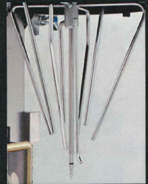
*The multi-angled Stirring Blade (Rice Washing Tank not shown)

The multi-angled design of the Stirring Blade ensures the rice is evenly stirred. The Bran – the hard outer layer of the grains of rice – is quickly and efficiently removed to contribute to efficient rice washing in a remarkably reduced amount of time.