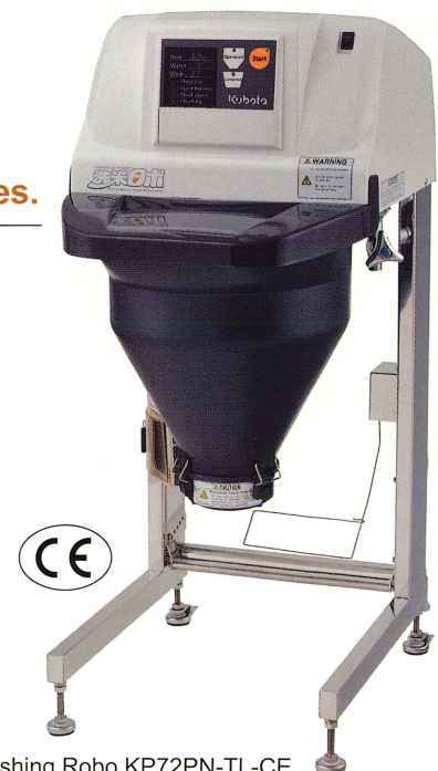
Kubota Rice Washing Robo KP72PN-TL-CE