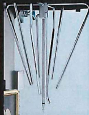
*The multi-angled Stirring Blade (Rice Washing Tank not shown)

The multi-angled design of the Stirring Blade ensures the rice is evenly stirred. The Bran – the hard outer layer of the grains of rice – is quickly and efficiently removed to contribute to efficient rice washing in a remarkably reduced amount of time.